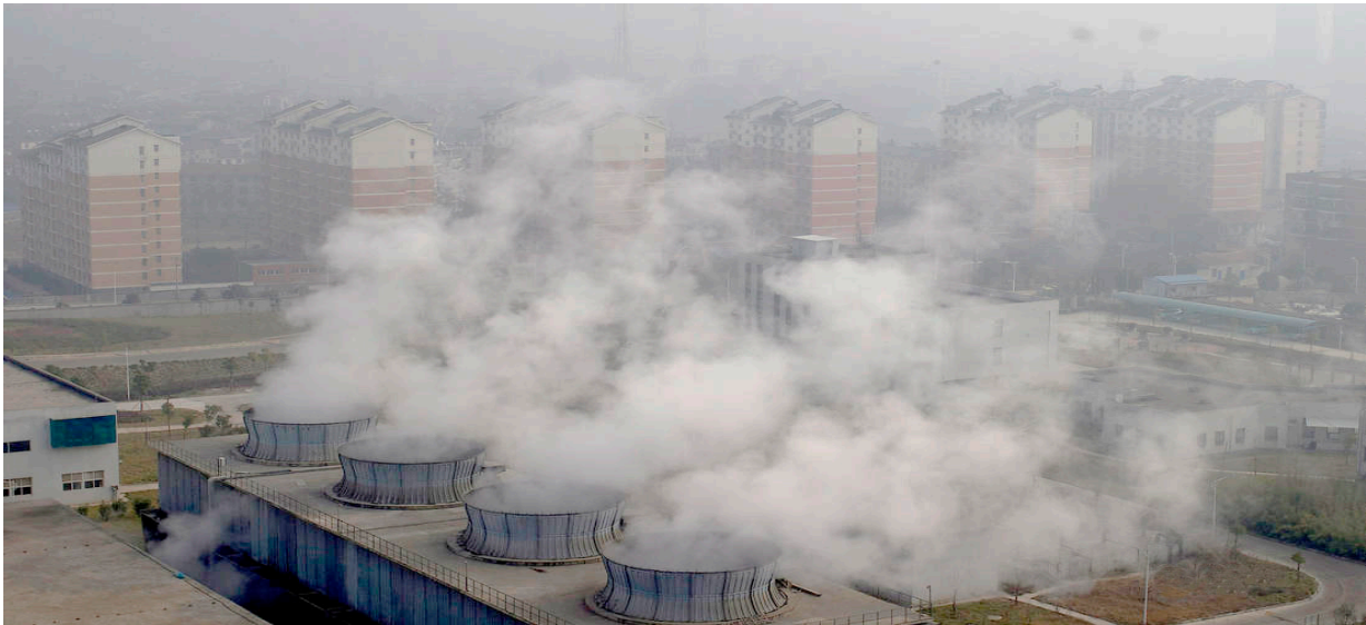
Figure 2. Guodingshan waste incineration plant with residential buildings nearby.

Various levels of governments in Wuhan pursue economic and political achievements unilaterally. They usually boost the GDP growth with investments in many fields, including waste incineration. Enterprises, in order to obtain maximum benefits, often collude with the EIAs and the governments to pass or even escape the EIA's evaluation. As a result, a prohibited plant ends up emitting excessive waste gas which damages the public interest (see Figure 2).