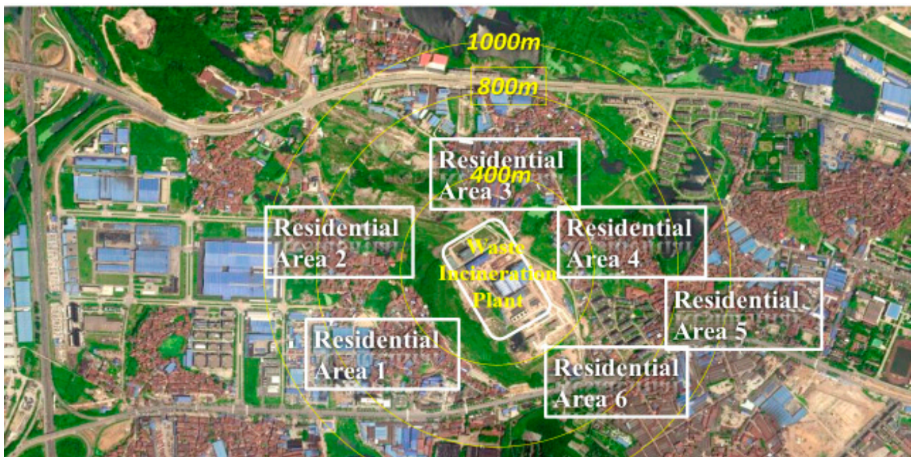
Figure 5. The location analysis of Guodingshan waste incineration plant.

The Guodingshan municipal waste incineration plant is surrounded by several residential areas. This is prohibited by national standards—Pollution Control Standards for Hazardous Wastes Incineration. According to the standards, the safe distance for waste incineration was set as 1000 meters before 2009. After 2009, it was adjusted to 800 meters, but the safe distance for the Guodingshan waste incineration plant was reduced to 400 meters by the local bureau of environmental protection. In Figure 5, we show three concentric circles which represent 400 meters, 800 meters and 1000 meters away from the waste incineration plant.