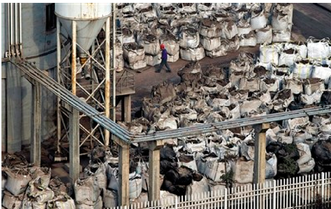
Figure 4. Fly ash in the open space of the Guodingshan waste incineration plant.

If the fly ash is not appropriately solidified, the numerous dioxins produced may contaminate the air, water and soil. Because of the low water solubility and long biological half-life of dioxins, even small concentrations in water and soil can become concentrated in the food chain to develop into levels dangerous to human health. In other words, the untreated fly ash is a dangerous pollutant and could seriously damage the public health.