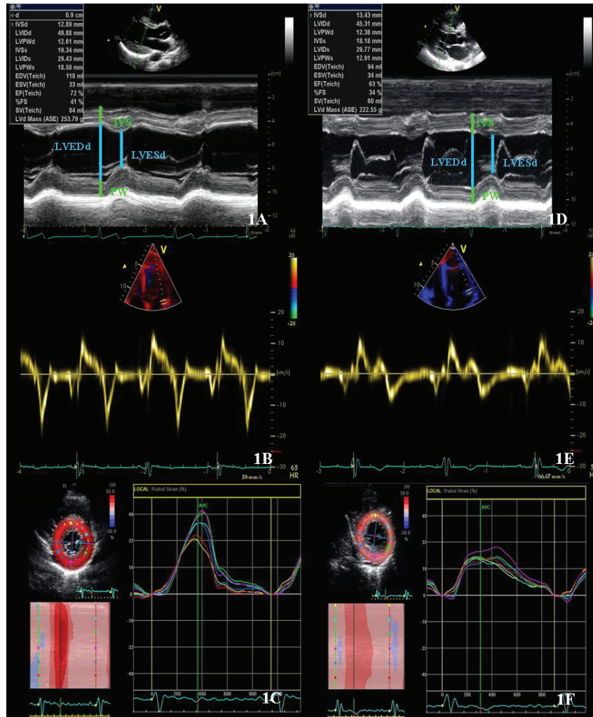
Figure 1. Echocardiographic assessment of an athlete with left ventricular hypertrophic adaptation (Figure 1: A, B, C) and a patient with a mild form of hypertrophic cardiomyopathy (Figure 1: D, E, F). Patients with hypertrophic cardiomyopathy present smaller LV end-diastolic diameters, reduced radial strain values and reduced velocities of the mitral annulus as compared to athletes.

hypertrabeculation has been described in athletes. Gati et al. 51 in a cohort of 1146 athletes studied by echocardiography, reported trabeculations in 20% of the athletes, and even more, around 8% fulfilled conventional criteria for the diagnosis of LV non-compaction cardiomyopathy; this prevalence raised to 13% when only black athletes were considered. LV non-compaction cardiomyopathy is a rare cardiomyopathy thought to be secondary to the arrest of normal myocardial development, resulting in multiple deep ventricular trabeculations 52 . This entity has a wide clinical expression from asymptomatic patients to advanced cases with three characteristic symptoms: heart failure, thromboembolic events and fatal arrhythmias 53 , and has indeed been related to exercise-related SCD in young athletes 54 . The mechanisms implicated in LV hypertrabeculation in athletes are still unknown, but the reported high prevalence suggests that it might be another expression of cardiac adaptation to increased preload and afterload influenced by genetic and ethnical factors 51 . Structural echocardiographic features that could help to differentiate cardiac adaptive remodeling from disease are: the location of trabeculations (apical region in LV non-compaction