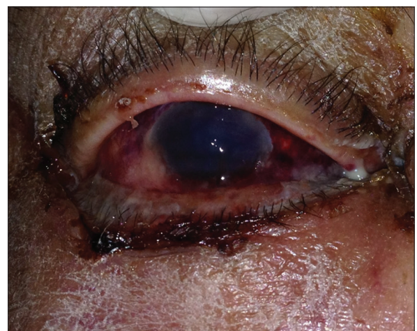
Figure 1: Dark red discoloration of the right eye.