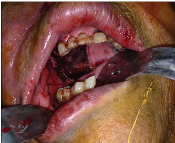
Figure 2: The black discoloration of the right half of the palate indicating palatal necrosis.

no abnormalities. The patient was admitted to the operation room (OR) for surgical debridement and to obtain a biopsy for confirmation. Under general anesthesia, a right maxillary vestibular incision and local tissue debridement were done, and no pus discharge was seen, tissues were extremely friable with abnormally minimal bleeding. Irrigation was done using normal saline, and the friable tissue was taken for histopathological confirmation. The patient was discharged from the OR to the intensive care unit (ICU) intubated, ventilated, and sedated for risk of the airway embarrassment and for further monitoring of consciousness. Post-operative medications included IV insulin infusion for tight glycemic control, IV administration of amphotericin B 1 mg/Kg/day with daily monitoring of kidney functions, IV ampicillin/sulbactam 1 g/0.5 g and clindamycin 600 mg both twice daily. Post-operative care included local irrigation with normal saline and local packing of a piece of gauze soaked in 1 vial of amphotericin B 50 mg twice daily. Sedation was discontinued in the ICU a few hours postoperatively, and the patient's conscious level was improving and was on spontaneous breathing (continuous positive airway pressure) mode on the ventilator machine. The following day the patient's conscious level deteriorated again