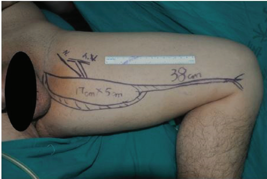
Figure 1 - Design of the gracilis musculocutaneous flap

6 weeks after surgery, and passive functional exercises were begun immediately after surgery. The rehabilitation protocol comprised acupuncture, moxibustion, and electrical stimulation.