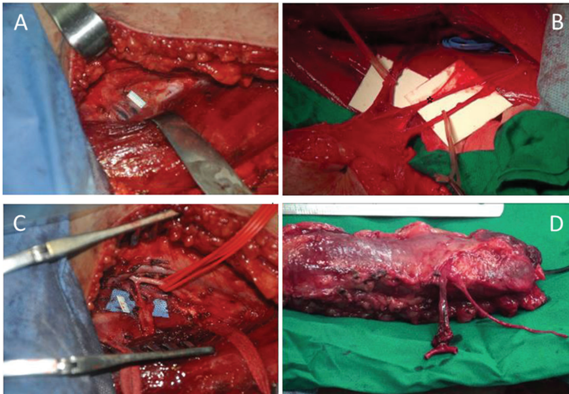
Figure 2 - Intraoperative images - A) Exposure of the dominant vascular pedicle. To avoid injury during the operation, the pedicle was not dissected at first. B) The neurovascular pedicle of the gracilis. Note that the sensory nerve branch (☆) must be resected to ensure enough motor nerve fiber regeneration (a, b). C) Exposure of the profunda femoris. A segment of the profunda femoris was prepared. It is unnecessary to perform a long dissection. D) The T-shaped arterial pedicle of the gracilis musculocutaneous flap (flap placed with the skin paddle downward).

Donor-site discomfort and dysfunction were evaluated 1 year after the FFMT. Subjective donor-site discomfort was specifically evaluated using a questionnaire adapted from