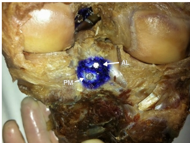
Fig. 1 – Photograph of the dissected specimen showing the insertions of the anterolateral (AL) and posteromedial (PM) bands.

Digital radiographs were produced in anteroposterior (AP) view, with the knee extended, and in absolute lateral view, with the knee flexed at 30°. The radiographs were produced using the following technical standardization: distance from the tube to the specimens of 120 cm; voltage of 48 kV and dosage of 5 mAs.