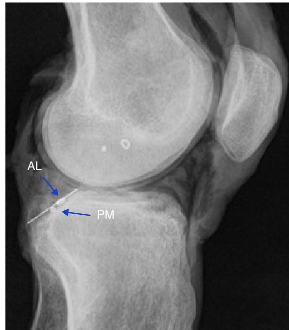
Fig. 3 – Radiograph in lateral view showing the line above the “facet of the PCL” and the insertions of the anterolateral (AL) and posteromedial (PM) bands.

We observed that the center of insertion of the PM band was always medial and distal to the center of insertion of the AL band. On AP radiographs, the mean distances from the centers of insertion of the AL and PM bands to the medial border of the tibia were 40.68 \pm 4.10 mm and 38.74 \pm 4.40 mm, respectively. The center of insertion of the AL band was at a location that corresponded to 52.32 \pm 4.55\% of the mediolateral measure-