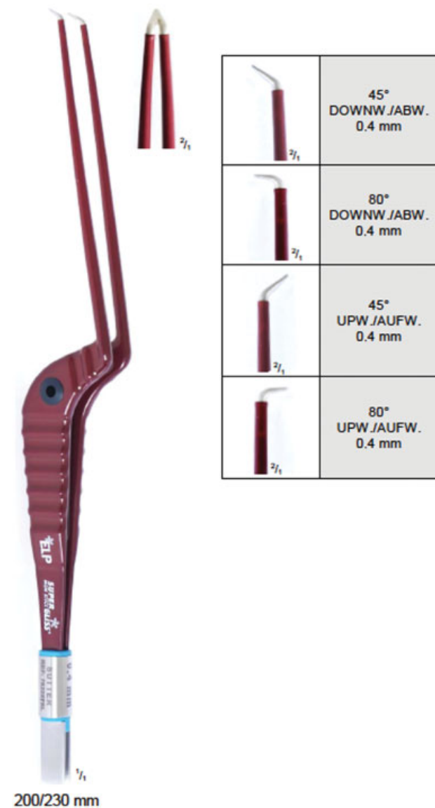
Fig. 1 The multi-angle microbipolar designed in two different lengths of 200 mm and 230 mm. Each of the two lengths can have a 45- or an 80-degree angle upward and downward. UPW, upward; DOWNW, downward.

The newly designed microforceps have an outer diameter of 1.9 mm and come in two different lengths: 200 mm and 230 mm. Each of these lengths can have a 45-degree or an 80-degree microtip angled upward and downward (→ Fig. 1) The new microforceps come in two microtip sizes: 2 mm for 45 degrees and 2.5 mm for 80 degrees (→ Fig. 2A, B)