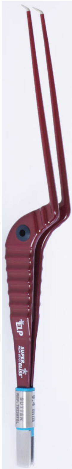
Fig. 3 The European model: 200 mm long, 45-degree angled microbipolar.