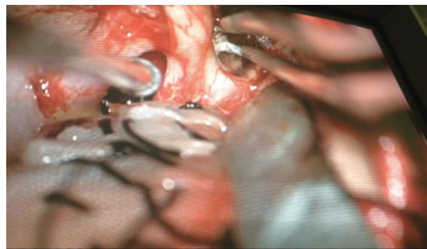
Fig. 5 Intraoperative use of angled microtip bipolar (45 degrees upward) in case described in Fig. 4 resulted in optimal access, easy coagulation, and even grasping and removal of the tumor around the left optic nerve (the suction tip shows left optic-carotid recess).