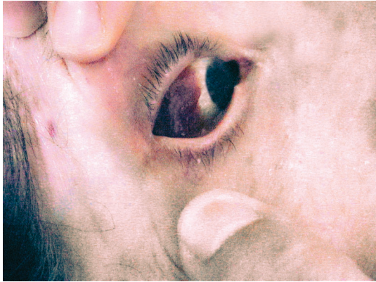
Fig. 1. Ocular B-cell lymphoma in a patient with chronic hepatitis C virus and Sjögren syndrome

in these diseases, 35 and one study has even suggested a lower frequency of HBV infection in patients with autoimmune diseases. 36 It has also been suggested that previous exposure to HBV might protect against the development of autoimmune diseases due to mechanisms such as antigen competition or down-regulation of allergic and autoimmune responses. 36-38 Although the reasons for the specific predilection of HCV for exocrine tissue are unknown, differences either in the viral structure (HBV is a DNA virus, while HCV is an RNA virus) or in the autoimmune responses they trigger might explain the variation in sialotropism.