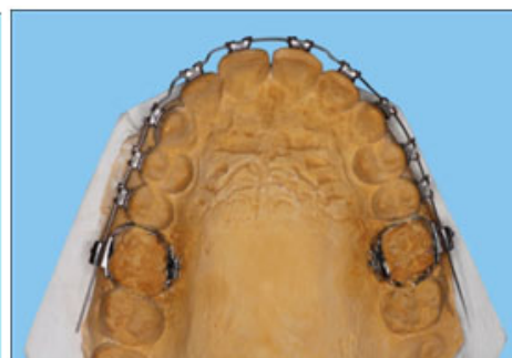
[Table/Fig-3]: Bracket-archwire assembly fabrication (0.018" ss)