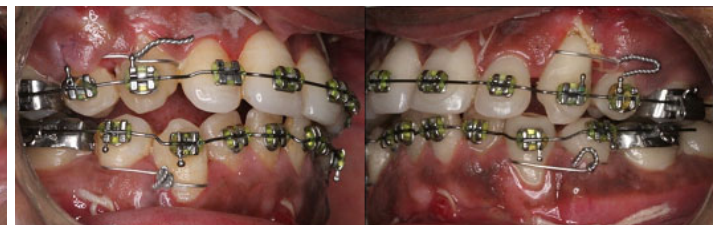
[Table/Fig-7]: Immediate postoperative—precise set-back of anterior segments after sliding the archwires through the bicuspid bracket and the molar tubes