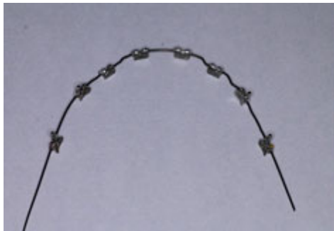
[Table/Fig-4]: Upper and lower 0.018" SS archwires bent to the malocclusion ready for bonding

A 21-year-old female with a gummy smile of 8mm, increased lower anterior facial height by 14mm, having a prognathic maxilla and a retrognathic mandible was to undergo a Le Forte I superior repositioning and an advancement genioplasty. It was decided to post the patient immediately for surgery without any dental decompensation on a surgery first basis. So the above mentioned procedure for bonding was followed with 0.019"x0.025" stainless steel archwires that was bent to the malocclusion, and the patient was posted for surgery immediately [Table/Fig-9,10]. The patient was followed up with regular post-surgical orthodontics using the MBT mechanics.