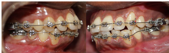
[Table/Fig-6]: Pre-surgical bonding completed (Note the first bicuspid were not bonded as they were indicated for extraction on the table)