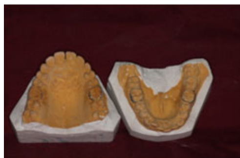
[Table/Fig-1]: Model with molar band