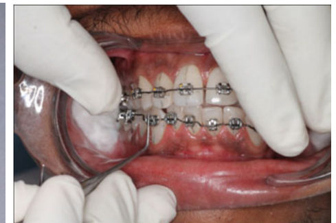
[Table/Fig-5]: Archwire and brackets with adhesive in position