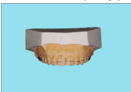
[Table/Fig-2]: Vertical and horizontal orientation lines