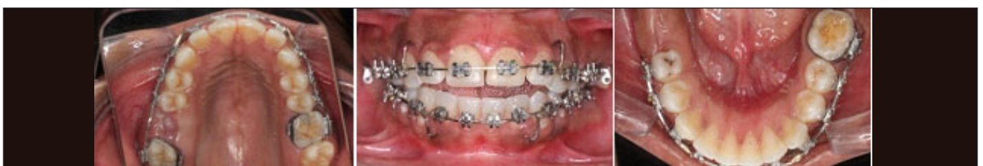
[Table/Fig-10]: Indirect bonding done using (0.019" x 0.025") stainless steel posted archwires