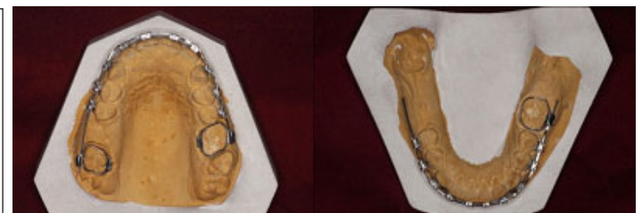
[Table/Fig-9]: Upper and lower 0.019"x0.025" stainless steel arch wires which are bent to the malocclusion with brackets fixed with elastic modules