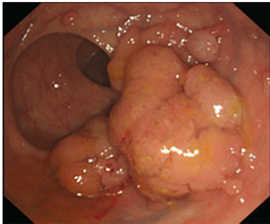
Figure 2. Endoscopic view of the flat, sessile rectal polyp (3.0 cm x 3.5 cm).