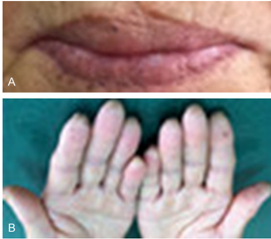
Figure 1. A. Hyperpigmented macules on the patient's lips. B. Hyperpigmented macules on the patient's fingers.