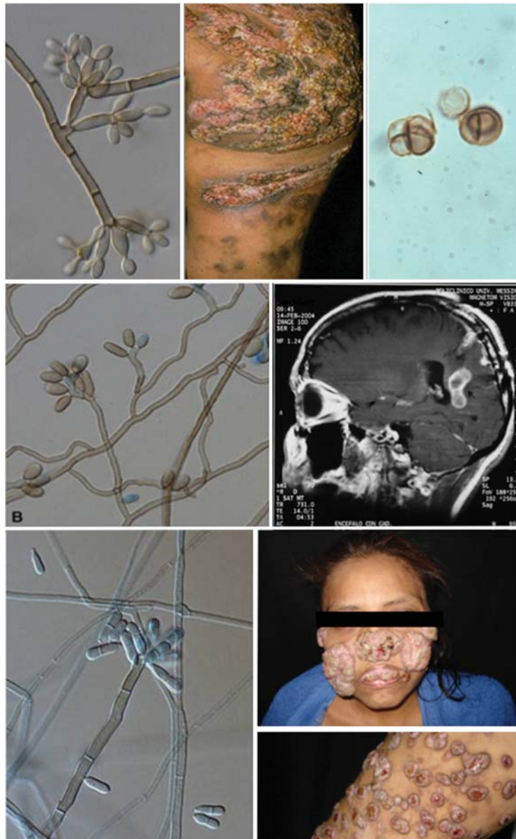
Figure 3. Chaetothyrialean agents of deep infections. Upper row: Fonsecaea pedrosoi causing chromoblastomycosis with muriform cells; middle row: Ramichloridium mackenziei , agent of cerebral phaeomycosis (case shown caused by Cladophialophora bantiana ); bottom row: disseminated infection caused by Veronea botryosa .

grow very slowly with olivaceous black colonies and produce thin-walled, sickle-shaped conidia with one or several transverse septa. Conidia are produced in packages from phialide openings on spherical conidiogenous cells or directly from hyphae.