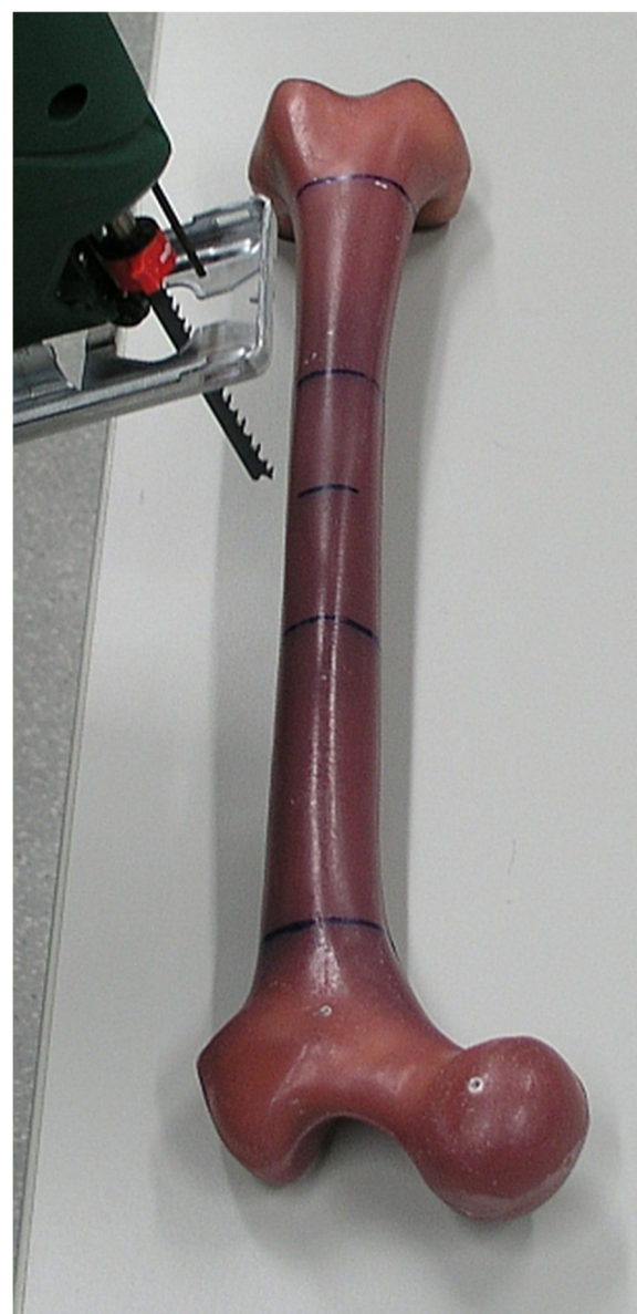
Fig. 1 Sawing of a standard midshaft transverse fracture exactly in the middle of the distance between the condyles and trochanter minor (AO paediatric comprehensive classification of long bone fractures: 32D41 [25]; LiLa classification for paediatric long bone fractures: 3.2.s.3.2. [26])

generation, Sawbones®, Malmö, Sweden). The whole setting followed in principle the standardised protocol of previous studies [18]. The femoral model measured 45 cm in length, with a central canal diameter of 10 mm. Each standard midshaft transverse fracture was sawed exactly in the middle of the distance between condyles and trochanter minor (AO paediatric comprehensive classification of long bone fractures: 32D41 [25]; LiLa classification for paediatric long bone fractures: 3.2.s.3.2. [26]) (Fig. 1). The fracture parameters were measured before use in the