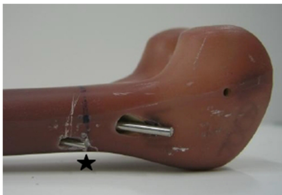
Fig. 3 Insertion point for the third nail 2.0 cm cranial anterior of the lateral entry point, the so called "3E" modification

The 24 composite models were divided into three configuration groups: