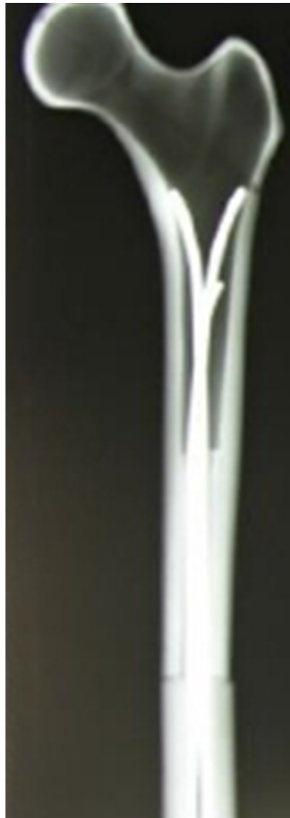
Fig. 4 X-ray of the proximal part of the Sawbone with a "3E" modification. Due to the conception of the composite femur, the ends of the nails were just inferior to the greater trochanter