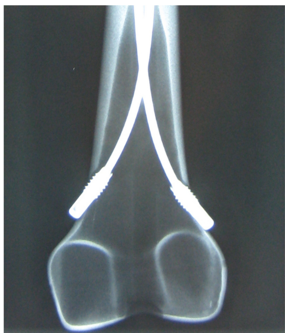
Fig. 5 X-ray of the distal part of the Sawbone with a “2CEC” modification

The course of the tests was equal to previously published studies: first, each specimen was placed in the machine for the four-point bending tests in a standardised order (anterior-posterior (AP), posterior-anterior (PA), lateral-medial (LM) and finally medial-lateral (ML)), followed by internal (IR) and external (ER) torsional tests and finally shifting tests in the 9^\circ position. The first cycle of the tests was used as preconditioning; data for evaluation were collected from three subsequent cycles. After the last cycle of testing, all specimens were again tested with anterior-posterior bending to check for possible destructive changes that could have influenced the results. Thus, we could exclude destruction of the osteosyntheses and the specimen. Deformation of the UTM