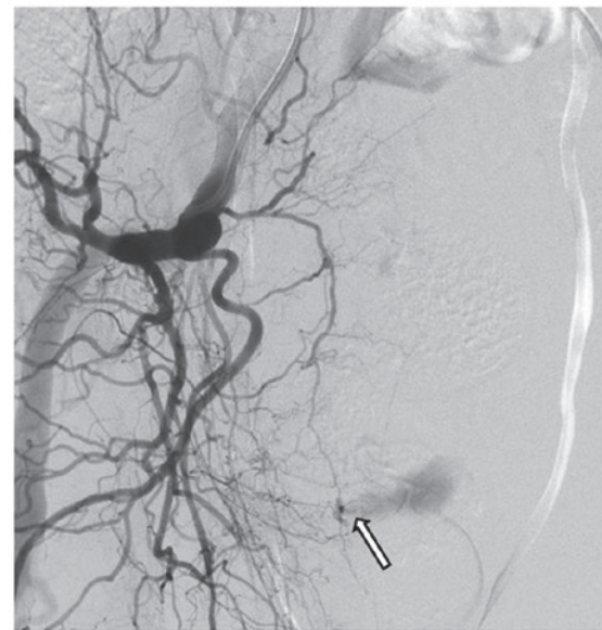
Figure 2. Digital subtraction angiography revealing active bleeding from a branch of the right obturator artery.

the hematoma, suggesting arterial bleeding. Digital subtraction angiography (DSA), performed via a transfemoral approach with selective catheterization of the two internal iliac arteries (Fig. 1), revealed active bleeding from a branch of the right obturator artery. We speculate that this branch may have been injured during pelvic lymphadenectomy (PLND). Super selective catheterization of the bleeding vessel was performed using a microcatheter (2.2 Fr/2.8 Fr) with a hydrophilic 0.016-inch guidewire. Embolization was performed successfully using a platinum coil (2x10 mm).