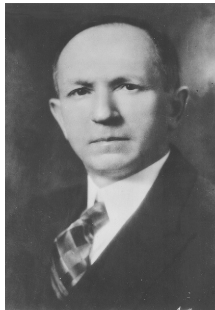
Alfred James Lotka, 1880–1949.

The first article that Pearl communicated to PNAS in 1920, "Analytical note on certain rhythmic relations in organic systems," typified Lotka's approach by opening with discussion of chemical systems and then moving to biological examples (4). The biological case was a hypothetical interaction between two species (a plant and an herbivore feeding on the plant). Lotka arrived at the unexpected result that their interaction would produce undamped or indefinitely continued oscillations in the two populations.