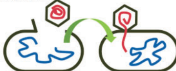
Figure 1. Mechanisms of bacterial horizontal gene transfer