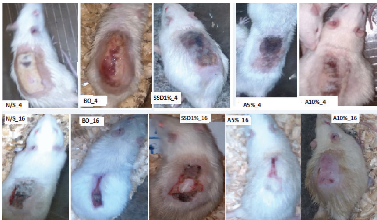
Fig. 2: Burn wound healing patterns in Normal saline (N/S), ointment Base (BO), 1% silver sulfadiazine (1% SSD) and 5 and 10% Arnebia euchroma ointment (5% A, 10% A) in rats after 4 and 16 days. Average wound size was smaller and the healing rate was faster in 5% A and 10% Arnebia euchroma ointment than other groups; p < 0.001 .

At the 7 th day of the experiment, histopathological evaluation showed the highest formation of granulation tissue for A. euchroma and the lowest extent for NS group (Table 5). The re-epithelialization parameter for 5% AEO treated group was significantly more than 1% SSD and controls groups ( p < 0.05 ) (Table 6). The collagen organization in 10% AEO group was better than 1% SSD and control groups on 21 st day. The score of collagen organization in 10% AEO, SSD, 5%