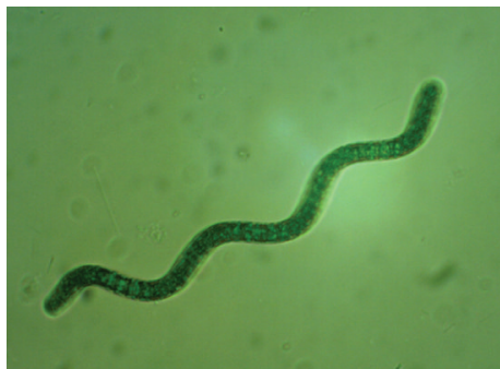
FIGURE 1: Spirulina sp. LEB 18 from LEB/FURG strains bank.

2.1. Spirulina . Spirulina ( Arthrospira ) is prokaryotic cyanobacteria (Figure 1) that belongs to Cyanophyta, which arose more than 3 million years ago, forming the current oxygen atmosphere, and has been important in the regulation of the planetary biosphere [21]. In 1981, Spirulina was approved by the FDA (Food Drug Administration) by the issuance of a GRAS (generally recognized as safe) certificate. The FDA has stated that Spirulina can be legally marketed as a food or food supplement without risk to human health [22].