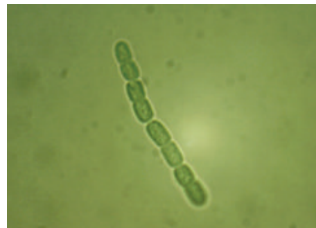
FIGURE 2: Microalga Nostoc ellipsosporum from LEB/FURG strains bank.

The world's largest producer, Hainan Simai Pharmacy Co. (China), annually produces 3000 tonnes of Spirulina biomass