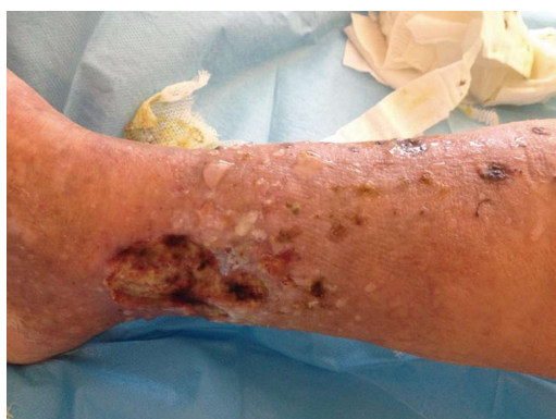
Figure 1 Purpuric rash with ulcers at the leg (patient 1).

AST: Aspartate aminotransferase; ALT: Alanine aminotransferase; γGT: Gamma-glutamyl transpeptidase.