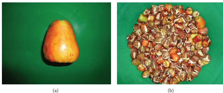
FIGURE 2: ((a)-(b)) Pictures showing a single cashew apple and a mixed variety of cashew apples from the Coastal Cashew plantation in KwaNgwanase, South Africa.