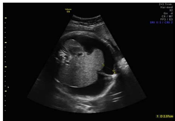
Figure 1 Ultrasound examination of the fetal abdomen at 36 weeks showing a massive fluid collection surrounding the liver.

Owing to the severe respiratory compromise, a paracentesis was performed immediately at birth and 280 ml of straw-coloured fluid were aspirated. Analysis of the peritoneal fluid showed an elevated white blood cell count with 93% lymphocytes, confirming the diagnosis of chylous ascites. Ascitic fluid culture for viral and bacterial infections was negative. Echocardiogram revealed no cardiac abnormality. Abdominal x-ray confirmed massive ascites with centrally located bowel loops (figure 2). Abdominal ultrasound also showed a large amount of ascites; the liver and spleen were normal.