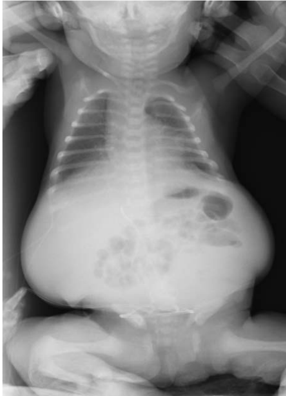
Figure 2 Orthostatic abdominal x-ray performed at birth after the paracentesis.