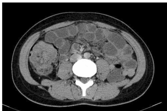
Fig. 1 Axial CT showing intussusception at the ascending colon with wall thickening

Ultrasound revealed a prominent swelling of the intestinal wall with target signs and a hyperechoic mass over the right lower quadrant area. An abdominal computed tomography (CT) was carried out to confirm the ultrasound findings. This showed a three-layered structure giving the characteristic target-shaped appearance in the ascending colon, highly suggestive for an ileocolic intussusception (Fig. 1). Additionally, the CT showed a right colic parietal thickening with an adjacent lymphadenopathy measuring 11 \times 13 mm but without signs of intestinal obstruction. Moreover, complete colonoscopy with exploration of the caecal region was paradoxically normal.