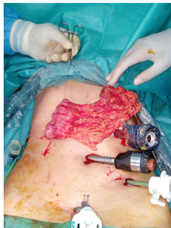
Fig. 2 Laparoscopic right hemicolectomy

Macroscopic examination of the resected specimen revealed a tumor mass of the caecal wall measuring 4 \times 5 \times 4 cm and occupying more than 3-quarters of the circumference (see Fig. 3). The histological analysis identified a moderately differentiated tubular adenocarcinoma invading the serosa (T3) without permeation of the lymphatic or venous capillaries. Mucinous component was estimated at 40%. No lymphatic metastasis of 28 nodes removed was seen and surgical margin was negative for cancer. Postoperative course was uneventful and patient was discharged 5 days after surgery.