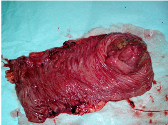
Fig. 3 Surgical specimen after opening of the colon with appearance of tumor formation at the caecal wall

Postoperative chest, abdomen, and pelvis CT scan were normal. Therefore, tumor is classified as stage II A (T3N0M0). Microsatellite status and immunohistochemistry of four deoxyribonucleic acid (DNA) mismatch repair proteins, including mutL homologue 1, post meiotic segregation increased 2, mutS homologue 2, and mutS homologue 6, were checked.