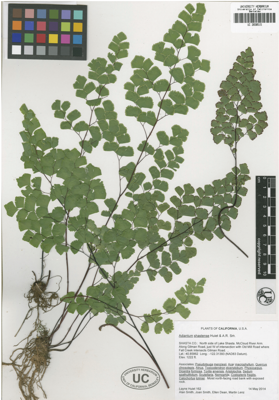
Figure 2. Holotype of Adiantum shastense Huiet & A.R.Sm. (Huiet et al. 162, UC)