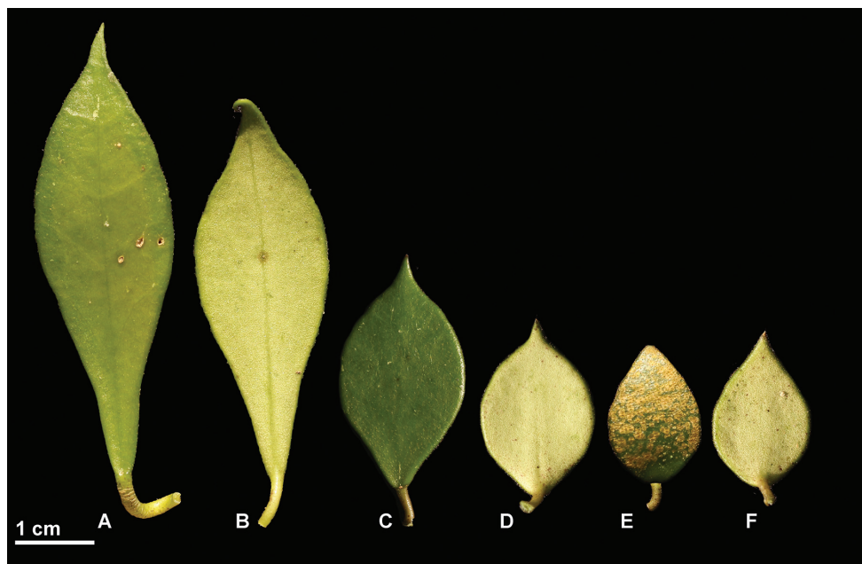
Figure 5. Hoya bakoensis leaves photographed in the field from Rodda M MR1042b ( A, B, E, F ) and Rodda M MR1042a ( C, D ) (SING) prior to pressing. A, C, E Adaxial side B, D, F Abaxial side.

Conservation status. Hoya bakoensis is locally common and well protected inside Bako National Park. Its conservation status is therefore Least Concern (LC) (IUCN 2014).