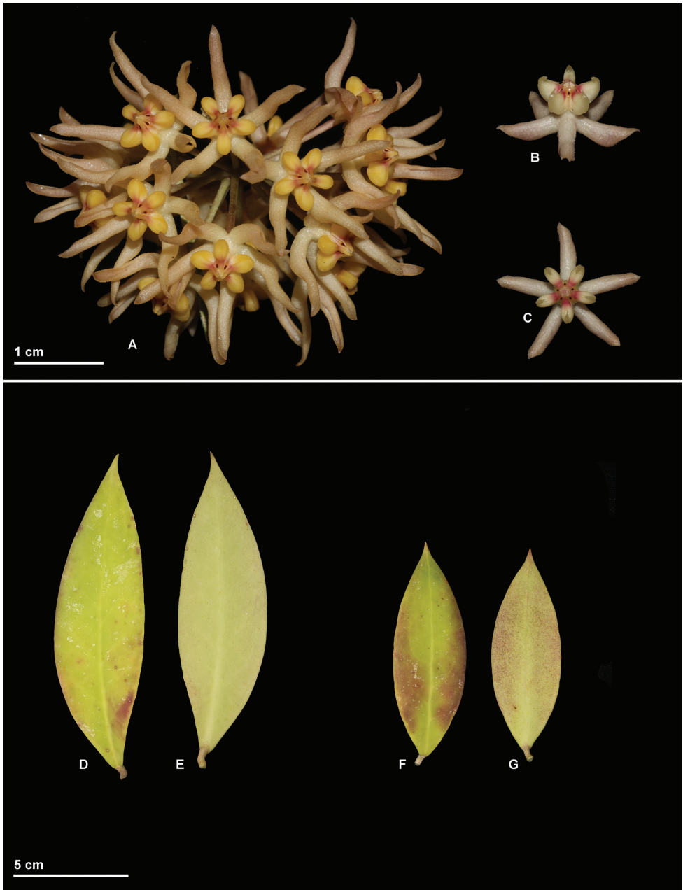
Figure 2. Hoya ruthiae photographed from Rodda M. MR606 (SING) prior to pressing A Inflorescence D, E, F, G Two leaves ( D, F adaxial surface E, G abaxial surface). Hoya uncinata photographed from Rodda M MR607 (SING) prior to pressing B Flower, lateral view C Flower, top view.