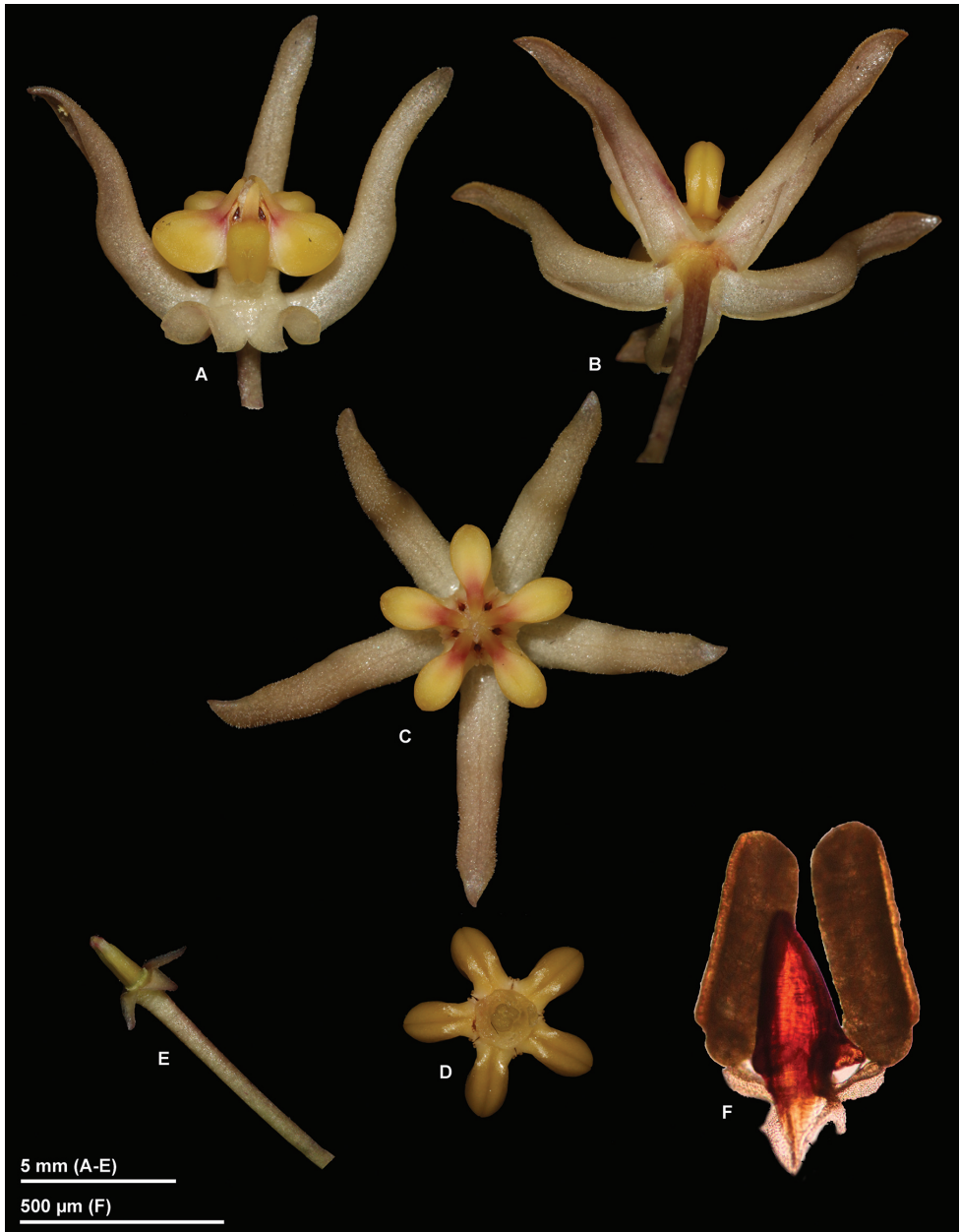
Figure 1. Hoya ruthiae photographed from Rodda M. MR606 (SING) prior to pressing A Flower, lateral view with two corolla lobes removed B Corolla, underneath C Corolla and corona, top view D Corona, underneath E Pedicel, calyx and ovaries F Pollinarium with twin pollinia.

lanceolate with a triangular acuminate apex, 9–10 × 3–4 mm, laterally revolute, lobe tips recurved. Gynostegium stalked, corona column conical 1–1.2 × ca. 2 mm diam, glabrous; corona staminal, 2.5–3 mm high, 6–7 mm in diameter, fleshy, yellow with a purple