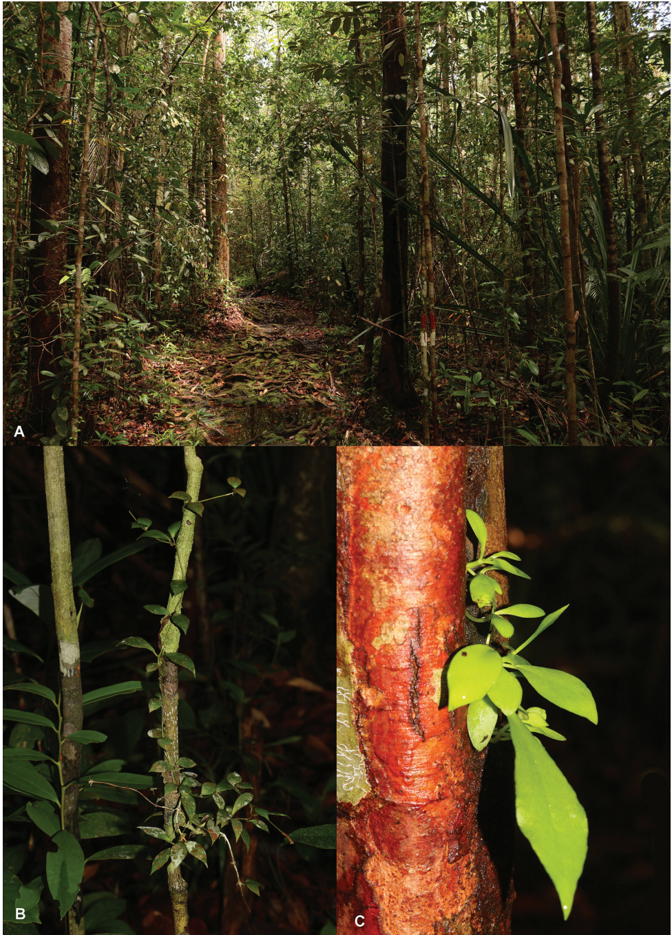
Figure 4. Hoya bakoensis in situ in Bako National Park (Sarawak, Malaysia) A Habitat, kerangas heath forest B Mature plant rooted inside the trunk of the host plant where an ant nest is located C Seedlings germinating from the opening of an ant nest in a hollow trunk.