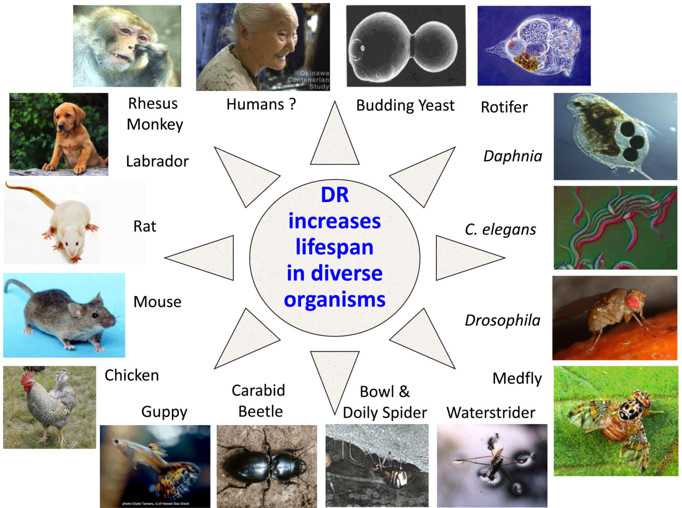
Figure 1. Dietary restriction increases healthy lifespan in diverse single-celled, invertebrate and vertebrate animals.