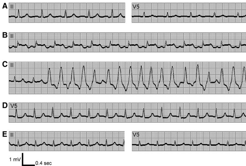
Figure 1. Traces from the monitored electrocardiogram of the patient, a 45-year-old Japanese man. Preincisional trace (A) (leads II and V5) showed sinus rhythm without ST-T change. The ST segment was elevated (B) 2 minutes after the portal reperfusion (lead II) and was followed by nonsustained ventricular tachycardia (C) (lead II). ST segment depression (D) occurred during extreme anemia (hemoglobin 0.6 g/dL) (lead V5). ST segment depression was resolved (E) concomitantly with red cell concentrates transfusion (hemoglobin 5.6 g/dL) (leads II and V5).