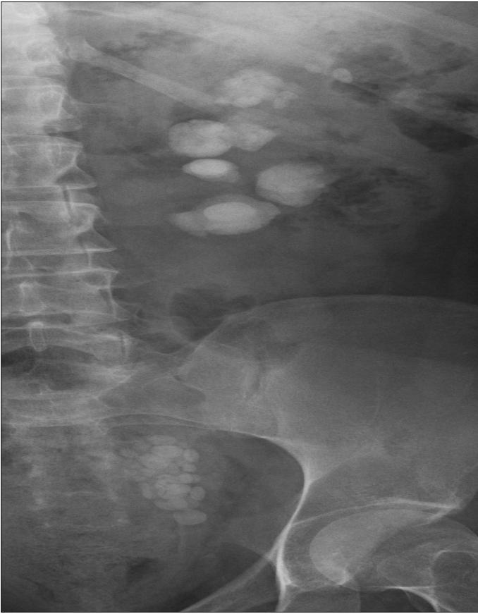
Figure 1. Plain radiograph of the urinary tract demonstrating several rounded opacities in the left kidney consistent with calculi and an aggregation in the left side of the pelvis that is most likely to be within the ureter (ureteric calculi).

urolithiasis or SWL, and ureteric obstruction and UTI were the presenting complaints.