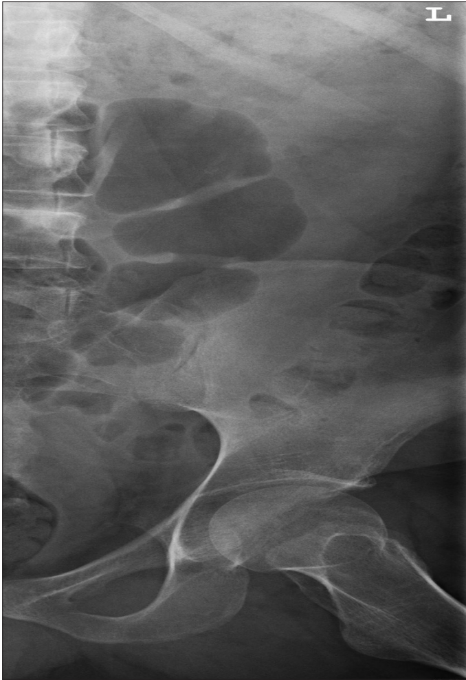
Figure 4. Plain radiograph of the urinary tract showing significant clearance of both the left renal and ureteric stones

In conclusion, we present a case with primary non-SWL-related massive Steinstrasse. To the best of our knowledge, no similar case has been reported to date.