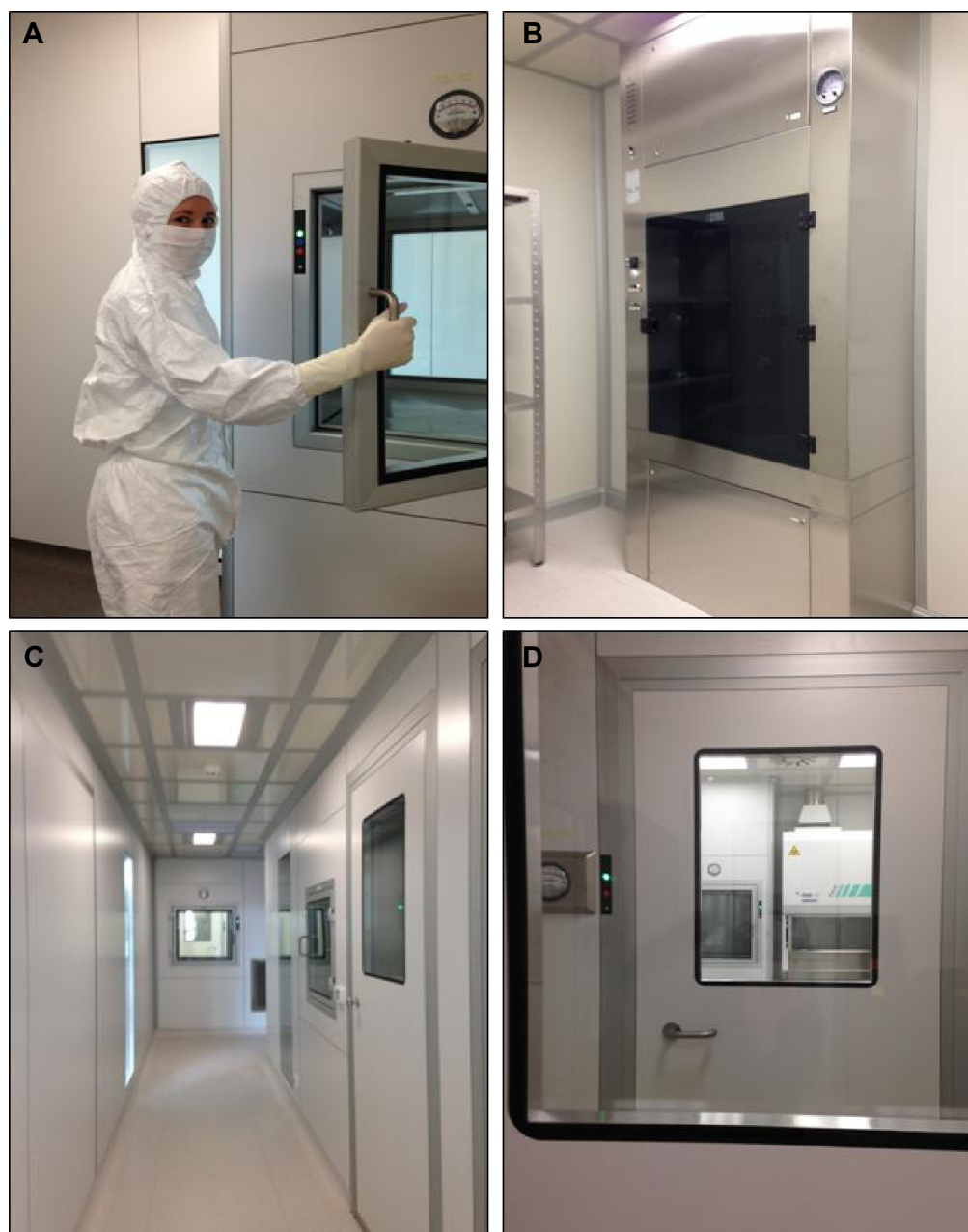
Figure 1 Representative pictures of the classified areas inside the Cell Factory.

Notes: (A) A GMP operator at work. The ventilated pass box is used to introduce the materials in the cleanroom. (B) An air shower in the storage room of a production site. It is used to remove the dust before introducing the materials in the classified areas. (C) Exit lane from the cleanroom. Each working room has its own, separated exit for the personnel and pass box for the materials. (D) An overview of the area for the preparation of materials. To access this area the operator must go through rooms of increasing air cleanliness.