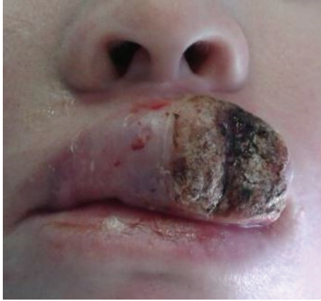
FIGURE 2: A 21-year-old HIV-seropositive Black albino woman with an exophytic crusted SCC of the upper lip, twelve months after she first noticed a small painless erosion. There was neither local lymph node involvement nor distant metastasis, and microscopically the carcinoma was moderately differentiated.

SCCS: Squamous cell carcinoma of the skin TYR: Tyrosinase MATP: Membrane associated transport protein ROS: Reactive oxygen species.