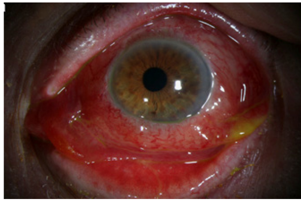
Figure 3 Hyaluronidase allergy: conjunctival injection and chemosis.

In 2012, Dieleman et al reported a cluster of 44 Dutch patients presenting with orbital inflammatory signs and symptoms after uneventful ophthalmic surgery. 72 On investigation, it was discovered that in all cases, 150–300 IU mL -1 HA had been added to the anesthetic mixture. Skin patch