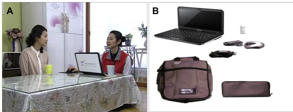
Figure 3. (A) Interview survey situation and (B) CAPI equipments. CAPI = computer-assisted personal interview.