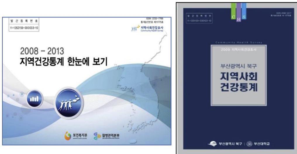
Figure 4. Korea Community Health Survey Report (2013).

survey system was determined as a 4-year period according to the community health care plan, which is supposed to be established and evaluated every 4 years. Depending on the importance, frequency, application, and social interests of the survey questions, the survey index and items were proportioned to three types of cycles: every year, every 2 years, and every 4 years (Table 2).