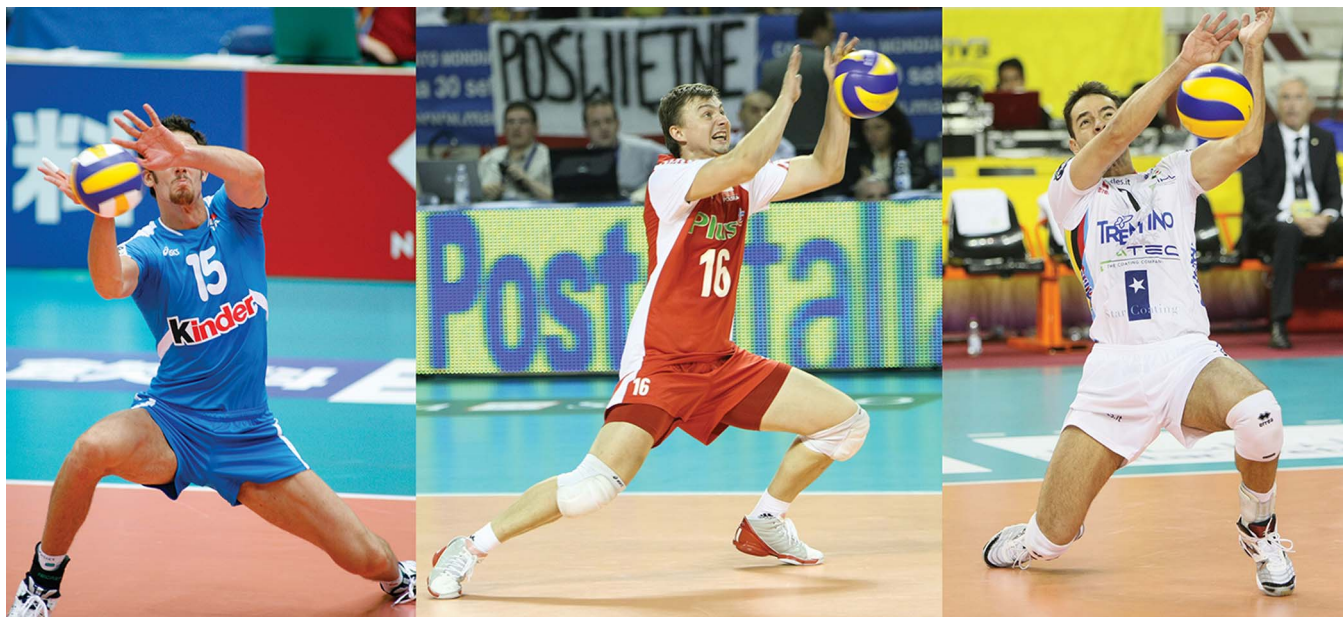
Figure 3 Overhand defensive techniques are frequently used in the back court, leading to a risk of finger injuries, particularly among libero players.

spread fingers. 15 16 However, it should be noted that rule changes have led to the development of new effective defensive techniques, the overhand dig, a common and effective defensive action used to stop hard-driven spikes in the back court (figure 3). This has been described as an additional mechanism for finger injuries in beach volleyball. 27