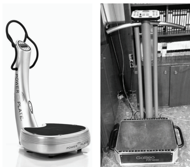
FIGURE 2: Power Plate and Galileo vibration platforms.

Level 2: one trial of level A2 or at least two independent trials of level B (see the Appendix); 3: one trial of level B or C (see the Appendix).