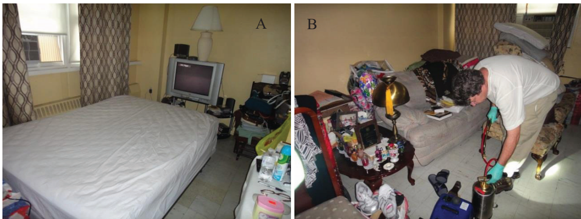
Figure 1. A typical test apartment. (A) bed area; (B) living area with a researcher using a B and G sprayer.

In each apartment, except for those in the Control, insecticide spray was applied to baseboards, holes in walls, cracks and crevices around bottom of sofas, detached headboards, and other non-sleeping areas where signs of bed bugs were seen (Figure 1B). No chemicals were applied in the Control apartments. Interceptors were installed immediately after treatment following the same manner as that for the pre-treatment monitoring.