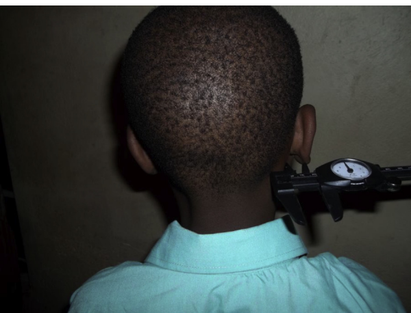
Fig. 4. Ear projection.

sample size in epidemiological surveys was used.