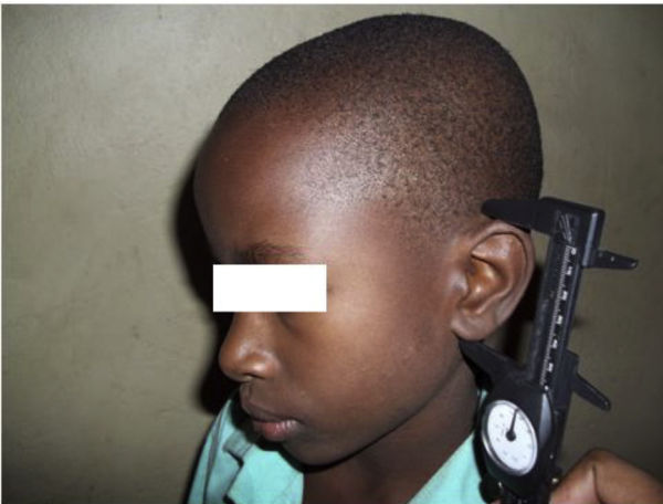
Fig. 3. Ear height.