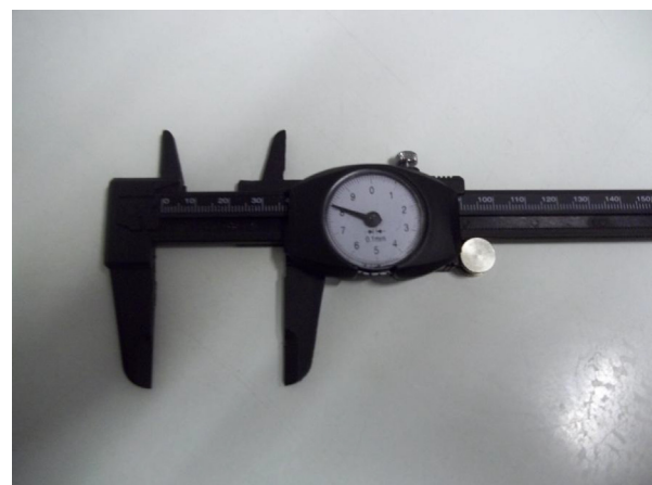
Fig. 1. Sliding caliper (accuracy – 0.01 mm).

The appropriate sample size for this population based survey was determined by 3 factors: a) the estimated prevalence of the variable of interest, b) the desired level of confidence, c) the acceptable margin of error. Thus the formula for calculation of