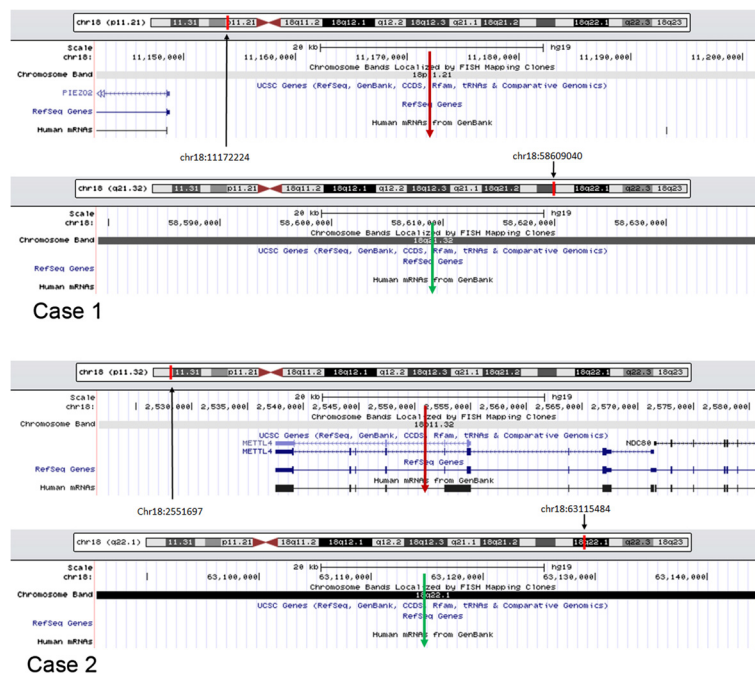
Fig. 3 Chromosome breakpoints and disrupted genes. Breakpoints are indicated by red and green arrows. No genes were disrupted by any of the breakpoints in case 1 or by one of the breakpoints in case 2. The second breakpoint in case 2 on the long arm of chromosome 18 disrupted METTL4

In the present study, we found two suspected cases of r(18) by GTG method (Fig. 1a), then used low-coverage whole-genome paired-end NGS to characterize the cases at a high resolution. We identified chromosome deletions on both arms, and the chromosome junctions at a resolution level of hundreds of base pairs. We also validated the chromosome deletions by SNP-array analysis, and used Sanger