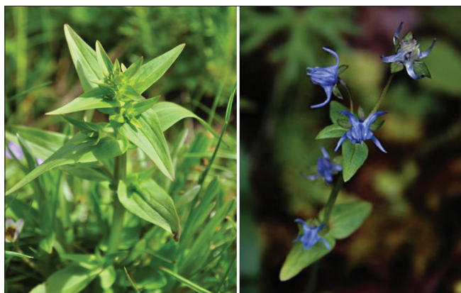
Figure 1: The habitat and its flower of Halenia elliptica D. Don