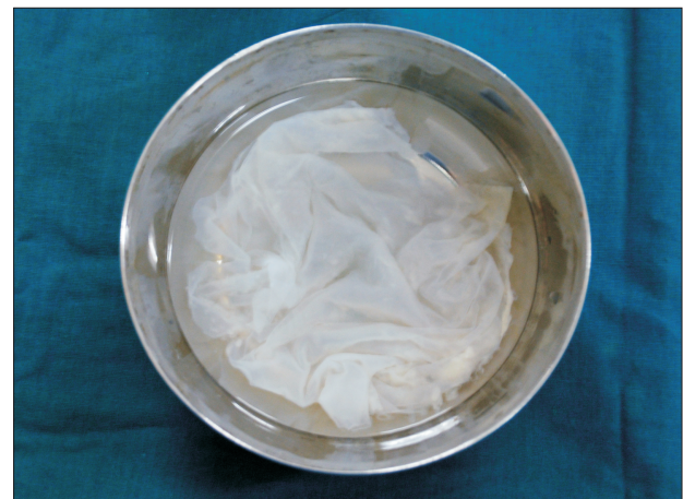
Fig. 4. Picture showing amniotic membrane stored in gentamycin solution. Subha Lakshmi et al: Repair of an oroantral communication by a human amniotic membrane: a novel technique. J Korean Assoc Oral Maxillofac Surg 2015

at a temperature of 4°C. On the next day, just prior to its application over the extraction socket of the recipient patient, the membrane was soaked in normal saline for a period of 10 minutes.(Fig. 4) This method of preparing and preserving the AM has been described by Kesting et al. 2 for the application of closing oroantral communications in minipigs. For our procedure, the AM was then folded in layers and applied over the extraction socket and secured with sutures.(Fig. 5, 6)