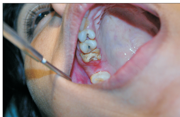
Fig. 7. Complete healing of the oroantral communication after 14 days of closure.

The HAM is a thin semitransparent tissue forming the innermost layer of the fetal membrane and was first introduced as a dressing in 1910 by Davis 8 . The AM consists of an epithelial monolayer, a thick basement membrane, and an avascular stroma. The AM contains no blood vessels or nerves; instead, the nutrients it requires are supplied directly by diffusion out of the amniotic fluid and/or from the underlying decidua. It is the innermost layer, nearest to the fetus, and consists of a single layer of cells uniformly arranged on the basement membrane. The basement membrane is one of the thickest membranes found in all human tissues. The support provided to the fetus throughout gestation by the basement membrane provides testimony to the structural integrity