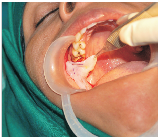
Fig. 5. Amniotic membrane being used in layers and sutured to close the oroantral communication.

Subha Lakshmi et al: Repair of an oroantral communication by a human amniotic membrane: a novel technique. J Korean Assoc Oral Maxillofac Surg 2015