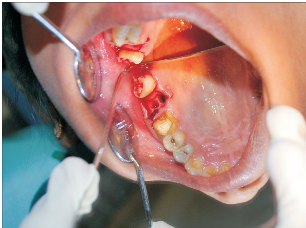
Fig. 1. Picture shows persistent 4 to 6 mm wide oroantral communication. Subha Lakshmi et al: Repair of an oroantral communication by a human amniotic membrane: a novel technique. J Korean Assoc Oral Maxillofac Surg 2015