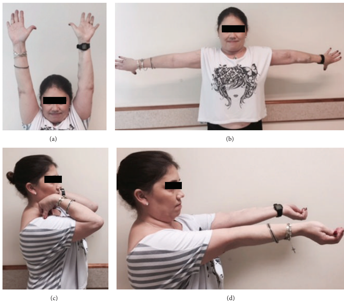
FIGURE 3: Clinical photograph showing elbow extension (a, b, and d) and flexion (c) at 3-month follow-up.

were the cause of weakening of the tendon tissue [11]. This mechanism can be explained by the effect of parathyroid hormone on bone matrix, increasing bone reabsorption, thus weakening the bone-tendon interface [12].