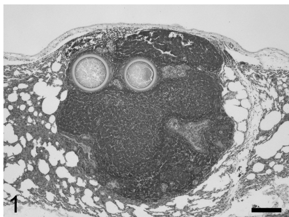
Fig. 1. Two adiaspores are surrounded by fused lymphoid follicles, forming a nodular lesion in the lung. Hematoxylin and eosin. Bar=200 \mu\text{m} .