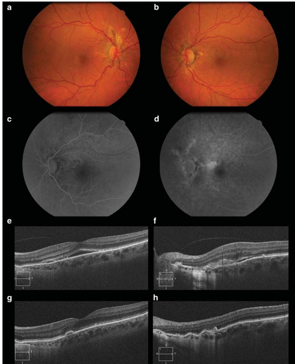
Figure 1 Colour fundus photographs of the first patient, whose sister was known to be affected by AS and pseudoxanthoma elasticum, show bilateral AS, OD (a) and OS (b), along with an extrafoveal greyish area of CNV, with associated subretinal haemorrhages in OS. Early-phase fundus fluorescein angiography demonstrates a well-demarcated lesion (c) with late leakage (d) in OS, compatible with a classic CNV. Spectral-domain optical coherence tomography reveals a neurosensory detachment involving the fovea (e) and a hyperreflective lesion with subretinal fluid above the retinal pigment epithelium in the cross-section through the lesion. After treatment, there was resolution of the foveal subretinal fluid (f) with scarring of the CNV (g).

The first is a 57-year-old woman with recent left eye (OS) distortion. Visual acuities (VA) were 20/20 right and 20/25 left. Fundoscopy showed bilateral AS and a classic CNV OS (Figures 1a and b). Fluorescein angiography (FA) and