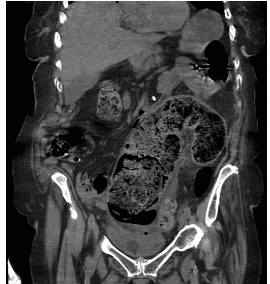
Figure 2 Faecal impaction extending proximally towards the descending colon. Extensive oedematous bowel wall due to compression from the faecaloma.

CT of the abdomen and pelvis showed marked rectosigmoid faecal impaction, compression of the urinary bladder (figure 1) and inflammatory changes in the wall of the rectum and lower sigmoid, consistent with a diagnosis of stercoral colitis (figures 2 and 3). The patient was treated with enemas and intravenous antibiotics; despite this, she continued to deteriorate and, given the high operative risk, was deemed unsuitable for surgery and subsequently died.