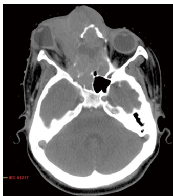
Figure 1 Axial computed tomography scan showing locally advanced esthesioneuroblastoma with extension to paranasal sinus and orbit.