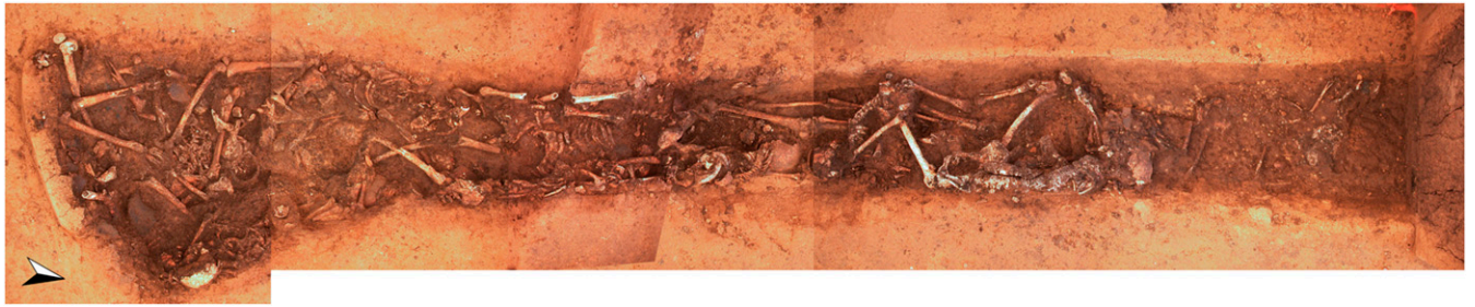
Fig. 1. Composite image of the LBK mass grave of Schöneck-Kilianstädten, Germany (area 4, feature 139). Individual images were adjusted for visualization of the complete feature.

Ofnet Cave in Germany, which shows the deposition of selected human remains with clear evidence of perimortem injuries and cut marks in Mesolithic times (30, 31). At that site, however, only detached and ochre-covered heads with articulated vertebrae were deposited carefully along with animal teeth ornaments in a special location, indicating much more complex behavior than a massacre (32).