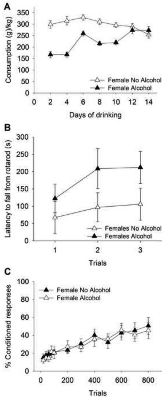
Figure 3. Moderate drinking does not impair motor performance or associative learning (A) Consumption was similar to females in experiment 1. Initially, animals that were given diets that contained alcohol drank less than animals not given alcohol. However, daily consumption was similar by the end of the two-week drinking period. (B) Females that drank alcohol performed similarly compared to females that did not drink alcohol when motor performance was tested on a rotarod on day 6 of the drinking regime. (C) Females that consumed alcohol emitted similar numbers of CRs during training as those that did not