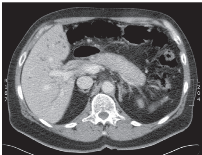
Fig. 2. A 58-year-old warehouse man of a truck manufacturing company presented with weight loss, jaundice, and abdominal pain. Serum IgG4 was 166 mg/dl. A CT scan revealed a sausage-shaped pancreas, which normalized after prednisolone treatment (20 mg/day).

We recently reported that the majority of two independent cohorts of patients with IgG4-RD consisted of 'blue-collar workers' with long-term (>1 year) or lifelong exposure to industrial solvents and gases [7]. Cross-validation of these findings in additional independent cohorts is needed.