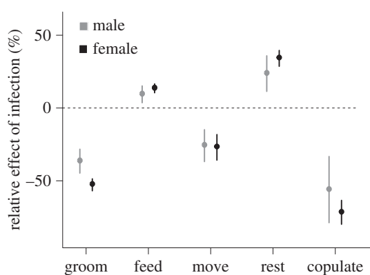
Figure 1. Mean relative change in the frequency of occurrence of each behaviour, separated by sex, as a function of infection (as determined by the presence of whipworm eggs in faeces). Negative values indicate a relative reduction in the frequency of a behaviour when individuals were whipworm-positive. Error bars, s.e.m.

first two components and plotted following standardization around zero on each axis. Infection status was colour coded and the minimum area of a given status was outlined using convex hulls. Each individual was represented twice in this analysis (once at whipworm-positive intervals and again at whipworm-negative intervals). PCA was used to visualize all activities together—the aforementioned analyses were performed with GLMMs as describe above.