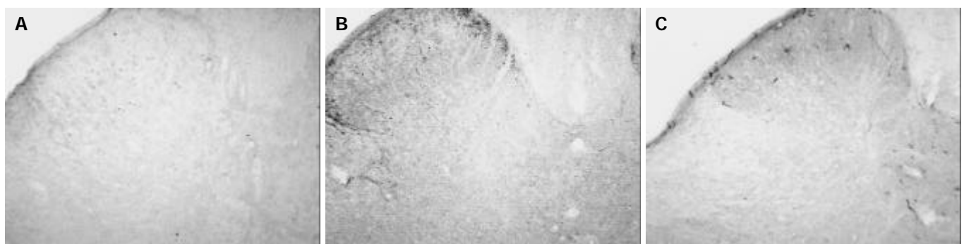
Figure 2 Sections from rats treated with tegaserod 2 mg/kg·d. ×10. A: After treatment with tegaserod, the number of Fos-IR cells was decreased significantly compared with that of the control group. B: Note that the density of SP in rats treated with tegaserod was decreased significantly compared with that of the control rats. C: The density of CGRP was not different between the treatment group and the control group.