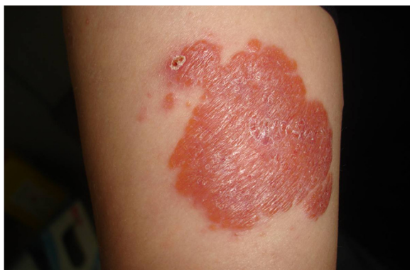
Fig. 1 Erythematous, nontender, well-defined plaque and satellite papules present over the left medial arm

Our patient was treated with isoniazid (5mg/kg), rifampin (10mg/kg), ethambutol (25mg/kg), and pyrazinamide (15mg/kg) daily for 2 months, followed by isoniazid and rifampin for 7 months. The cutaneous lesions started to regress within 3 months and had completely healed with atrophic scarring and postinflammatory hyperpigmentation after 9 months (Fig. 3).