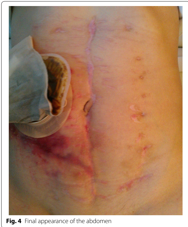
Fig. 4 Final appearance of the abdomen

fistula, intraabdominal abscess, and abdominal wall hernia (around 25–35 %) (D’Hondt et al. 2011; Brandl et al. 2014; Verdam et al. 2011). We have several techniques for the TAC: Negative Pressure Wound Therapy (NPWT) VAC, Vacuum pack, Zipper, Artificial burr, Mesh/sheet, Silo, Dynamic retentions sutures, etc (Suliburk et al. 2003; Tremblay et al. 2001; Wittmann 2000; Cuesta et al. 1991).