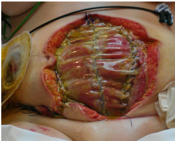
Fig. 1 Bogotá bag

The patient was discharged from the ICU after 2 days since the primary closure. Finally the patient was discharged a week from the Hospital. There was no