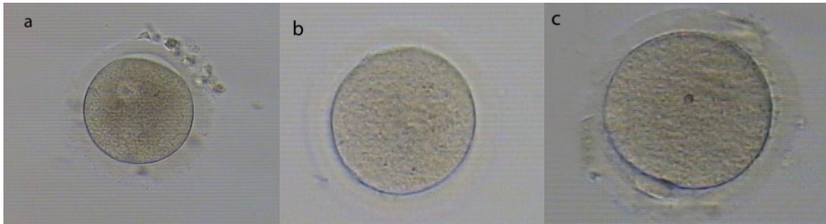
Figure 1. Morphological markers characterizing the meiotic status of human oocytes.