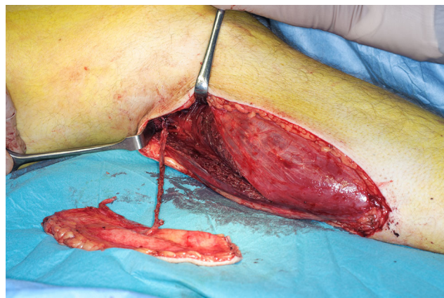
Fig. 2 The MSAP flap after dissection including the harvested subcutaneous vein

The median flap length was 10 cm (range 7–14 cm), and median flap width was 5 cm (range 3.5–8 cm). The median artery diameter was 1.25 mm (range 1–1.5 mm), and the median vein diameter was 2 mm (range 1.5–2.5). The median pedicle length was 10 cm (range 8–12 cm). The median thickness was 5 mm (range 4–8 mm). Either the facial or superior thyroid vessels were used for anastomosis for oral