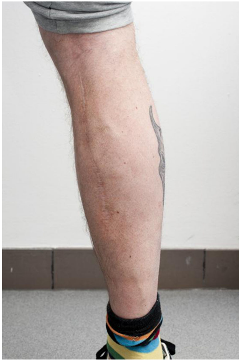
Fig. 3 Typical postoperative scar at donor site 3 months after surgery

reconstruction. For the plantar defects, the posterior tibial vessels were used.